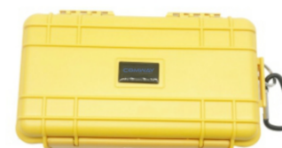
OTDR launch cable box